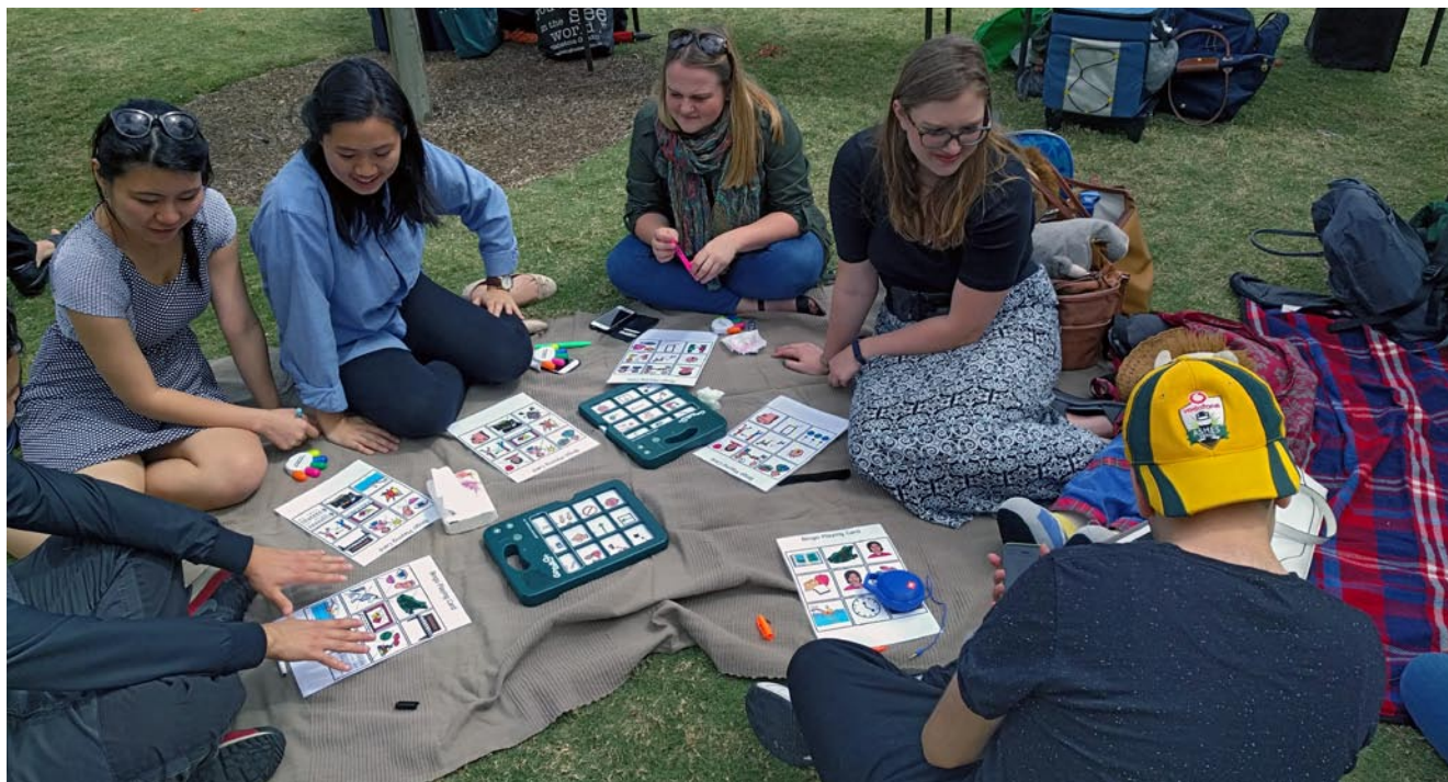
Participants learning about AAC